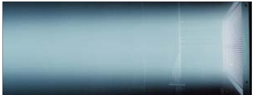
A HiPEP thruster undergoes wear testing at NASA Glenn.

Princeton University leads a NASA-funded effort to develop ALFA 2 , a high-power lithium-fed magnetoplasmadynamic (MPD) thruster that can operate at 250 kW with an I_{sp} of 6,000 sec and